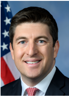
Representative Bryan Steil (R-WI)