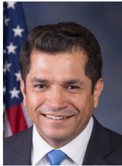
Representative Jimmy Gomez (D-CA)