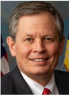
Senator Steve Daines (R-MT)

Congressman Bryan Steil was elected in 2018 and has earned a reputation for working hard for Wisconsin during his first terms in Congress. He currently serves on the House Financial Services Committee, which oversees all components of the nation's housing and financial services sectors. Congressman Steil is focused on making the American dream achievable for everyone. In 2023, Congressman Steil was appointed Chairman of the Committee on House Administration. He previously served as Ranking Member on the Elections Subcommittee and is focused on ensuring the House is open, secure, and accountable to the American people, and on strengthening Americans trust in our elections.