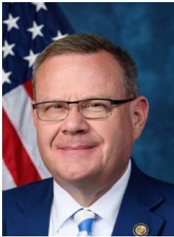
Representative Tim Moore (R-NC)